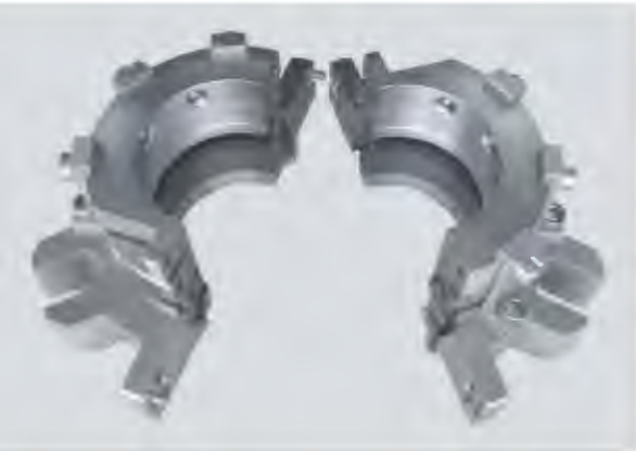
CIERRE PARTIDO SIMPLE